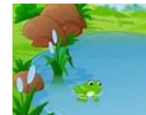
'turtle diary frog life cycle' - YouTube

Listen/watch the story of Mr Jeremy Fisher. ( The Tale of Mr Jeremy Fisher by Beatrix Potter)