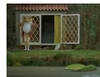
Royal Ballet The Tale of Jeremy Fisher - YouTube